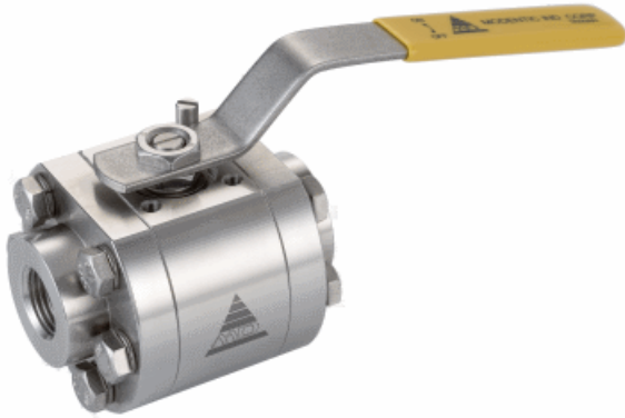
Fig no. HPV-40FSA Reduced Bore 1/4" ~ 2" DN 8- DN 50