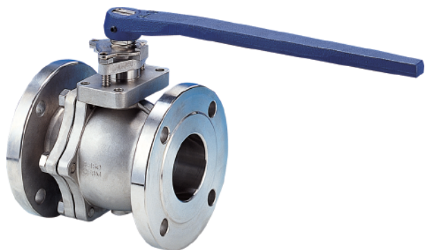
Fig No. MD-82 Full Bore DN15 ~ DN100 ( 1/2" ~ 4" )

MONEL® 400 / PN40 for DN15 ~ DN50 PN16 for DN65 ~ DN300