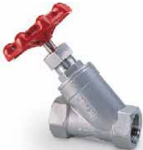
Fig No: YGB-800 1/4" ~ 2" DN8 ~ DN50