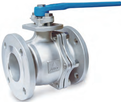
Fig No: MD-52 Full Bore 1/2" ~ 6" DN15 ~ DN150